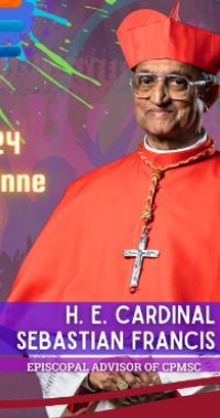
H. E. CARDINAL SEBASTIAN FRANCIS